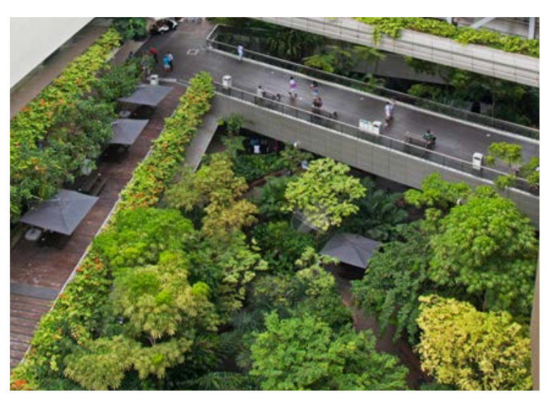
The Khoo Teck Puat Hospital, Singapore<sup>13</sup>

They may not have had modern carefully controlled studies but over many centuries, even millennia, those who create hospitals have instinctively known this to be true. In the Middle East, South America and North Africa, the traditional design of a central court yard provided not only shade from the harsh sun, but also a calm and relaxing environment for patients to enjoy. In the UK, during the first world war, the important function of gardens was recognised in the rehabilitation of patients. Greenery was an essential feature for many auxiliary hospitals and convalescent homes providing injured soldiers with a sense of place and serenity after the horrors of the war.