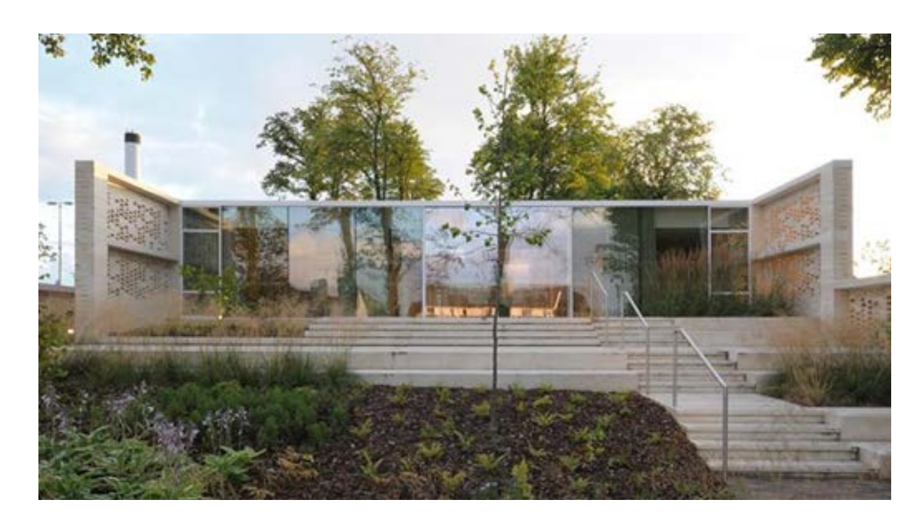
Maggie's Centre, Lanarkshire23