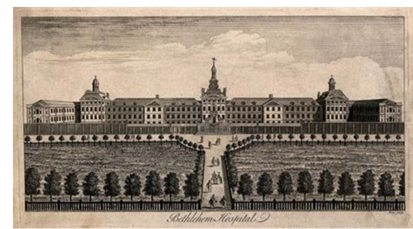
The perfectly symmetrical Bethlem Royal Hospital, Beckenham <sup>47</sup>

Create symmetry. As human beings, we are naturally drawn to symmetry. A 2006 study by Michigan State University, in cognitive science and neurology, used functional MRI to investigate the relationship between symmetry and aesthetic preferences. Both metabolic and behavioural findings showed that 66 per cent of the symmetric items were judged to be beautiful compared to 42 per cent for non-symmetric items.<sup>46</sup> This idea of symmetry was a hallmark of much 18th and 19th century hospital design. Architectural features where designed to be symmetrical offering engaging and pleasant environment at a human scale.