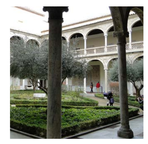
Hospital de Santa Cruz, Chile with a sequence of courtyards<sup>5</sup>

The NHS's new hospitals should not make this mistake. Here's how.