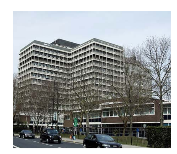
Charing Cross Hospital, London<sup>30</sup>