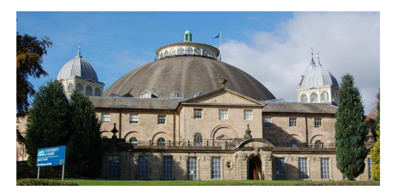
Former Buxton Hospital, Derbyshire <sup>31</sup>