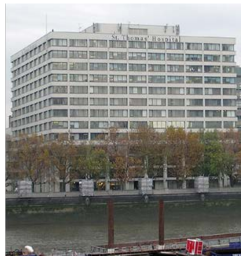
St Thomas Hospital, Lambeth. Before (top) and after (bottom)<sup>7</sup>